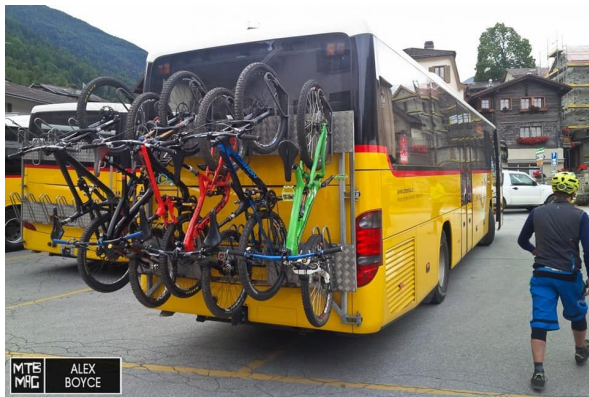
Example: Swiss Poste Bus - Six bike rack capacity