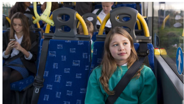
Example of seatbelts on public transit