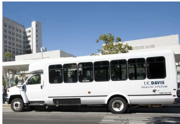
UCD Health System Shuttles transport community to parking, light rail, Midtown