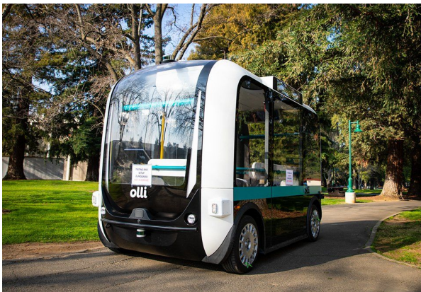
Autonomous Olli bus at Sacramento State transports community throughout campus